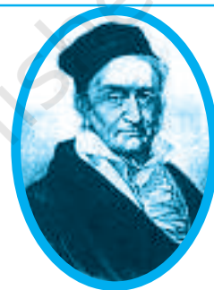
Carl Friedrich Gauss (1777 – 1855)

Carl Friedrich Gauss is often referred to as the 'Prince of Mathematicians' and is considered one of the three greatest mathematicians of all time, along with Archimedes and Newton. He has made fundamental contributions to both mathematics and science.